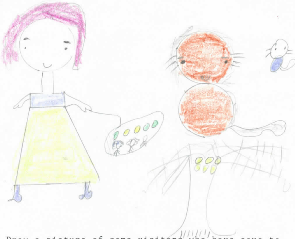
Draw a picture of some visitors who have come to Jamaica from far away.

If you would like to explain your drawing, use this space.