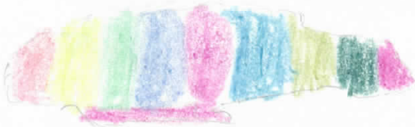
Draw a map that shows Jamaica. It can be any kind of map as long as it includes Jamaica.

This is Jamaica's map it is a small island But we love Jamaica, Jamaica is a free country.